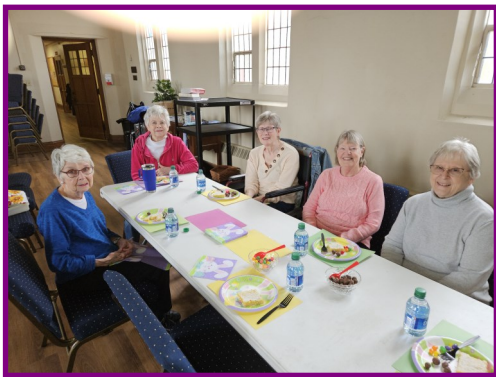
Hannah Circle members enjoying treats.

Both Hannah & Susanna Circles met in person at church on March 19th. Our program was centered on Matthew 5:13: "You are the salt of the earth; but if salt lost its taste, how can its saltiness be restored?" We sampled various salts and did an art project that helped us understand the impact that salt has on watercolors (See bookmark picture). This led to our discussing how we are to be the salt of the earth (followers of Jesus) and consider ways that we can keep our saltiness while involved in mission projects for women, children & youth around the world through United Women in Faith.